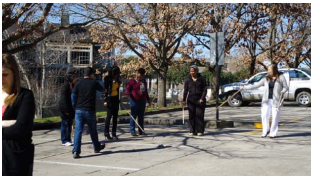
Project AIM teachers from the Baton Rouge area participate in an outdoor measurement activity.