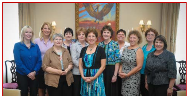
A group of Louisiana Presidential Awardees in science and math were in attendance at the 2010 state recognition ceremony held at the Governor's Mansion in September. Nominations are now being taken for the 2011 award for math and science teachers in grades 7-12.